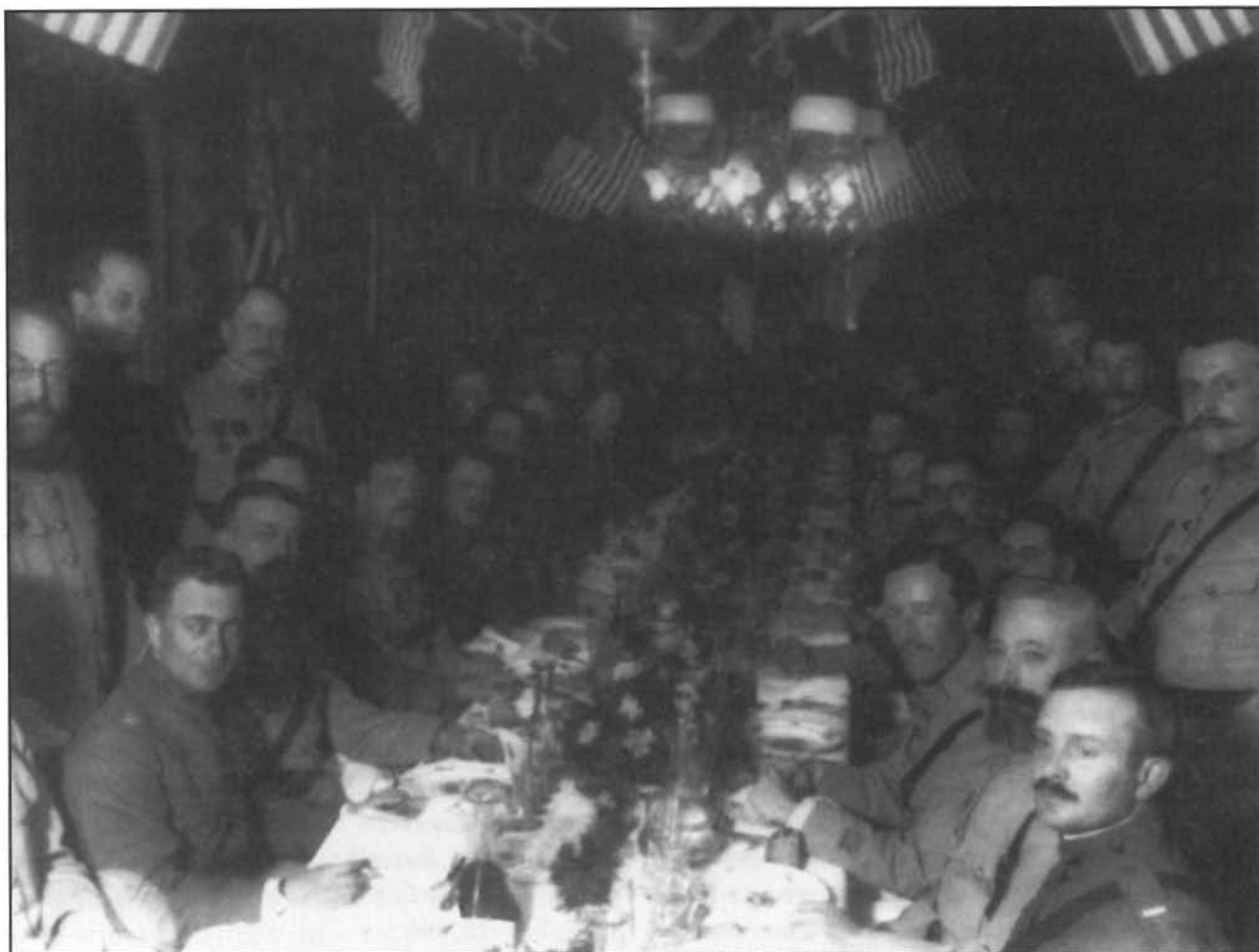
French officers honor their American comrades-in-arms at a banquet in the Hôtel des Vosges in Lunéville, France, on 18 March 1918.

they are persuaded that victory will not escape us.” 50 In mid-July, on the eve of the combined Franco-American offensive between the Marne and Aisne Rivers near Soissons which gave the Allies the initiative and began the series of operations that would result in Germany’s defeat, the Sixth Army commander, who had several U.S. divisions under his command for the operation, stated, “One can see that the military situation will in the near future turn to the benefit of the Allies, thanks to the resources that America has liberally placed in the service of the common cause. The continual arrival of new, robust, combative troops with an abundance of matériel reassures our men and arouses their highest hopes.” 51 Two weeks after the recapture of Soissons, the commander of Seventh Army remarked on the importance of that counteroffensive in changing the attitude of his soldiers from “somber” to “clear enthusiasm.” 52 At the same time the Second