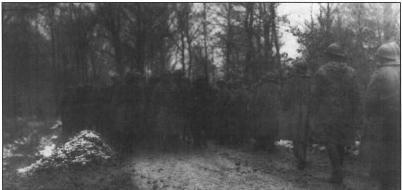
Company D, 165 th Infantry, an element of the 42d Division, advances past troops of the French VII Corps, whom they were supporting, near Lunéville, France, on 1 March 1918.

By mid-December, the French high command noted a "crisis of pessimism" among the soldiers and cited as major factors events in Russia and German propaganda. 39 Pétain had painted a bleak picture of the strategic situation at the first meeting of the Comité de Guerre convened by Prime Minister Georges Clemenceau earlier that month. 40 The situation would, however, become even more daunting, as French intelligence reported in March 1918 that the number of German divisions on the Western Front had increased to 188 from 157 two months earlier. 41 Even