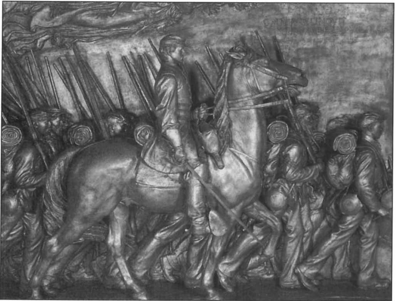
Memorial to Colonel Shaw by Saint-Gaudens