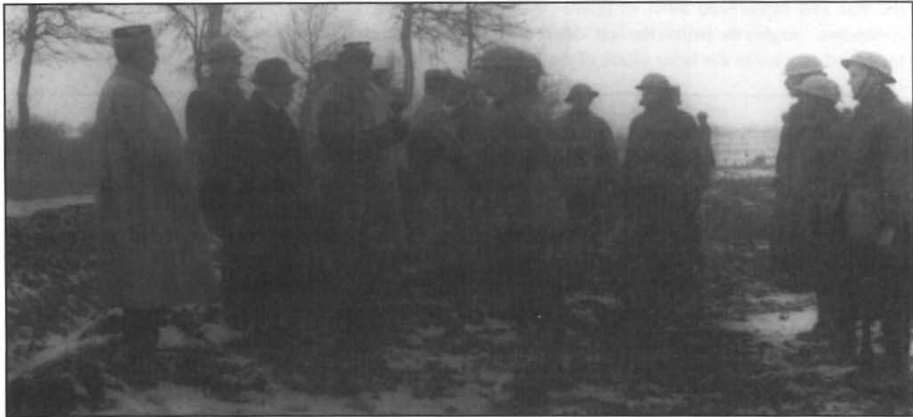
American soldiers of the 18 th Infantry and 6 th Field Artillery, both elements of the 1 st Division, receive the French Croix de Guerre on 3 March 1918 for their gallantry in a raid conducted two days earlier. French Premier Georges Clemenceau, third from left, attended the ceremony.

Americans much credit for reviving French morale. 1 British historian John Keegan's recent book, The First World War , exemplifies this view. While Keegan highlights the appearance of the Americans in the title of his final chapter, "America and Armageddon," he largely discounts their military significance. Keegan emphasizes the Americans' large numbers, but he neglects their contribution to the fighting and the impact of their combat successes on the revival of French determination and hope. 2 Indeed, he largely dismisses the U.S. Army's contribution by repeatedly mentioning its lack of professionalism and competence and by neglecting its achievements on the battlefield. Instead, using the colorful language that makes his books appealing to so many readers, Keegan merely explains