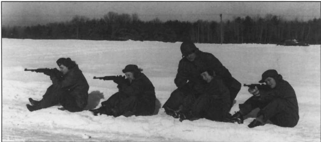
WACs receive voluntary instruction in shooting a carbine at Camp McCoy, Wisconsin, January 1951.

In the midst of the rapid postwar demobilization, military leaders acknowledged that they did not want to lose all their uniformed women. The U.S. military was charged with fielding armies of occupation in Japan, Germany, and Austria, while maintaining a force capable of defending the nation against the emerging Communist threat. Having skilled and efficient servicewomen working behind desks in military offices